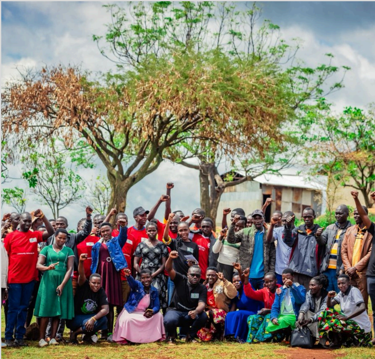
A group photo of the Benet community , YGC Staff and Partners